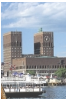
Oslo City Hall.