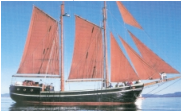
Boat tour on the Oslo fjord.

Boat tour for five hours on the fjord (optional)